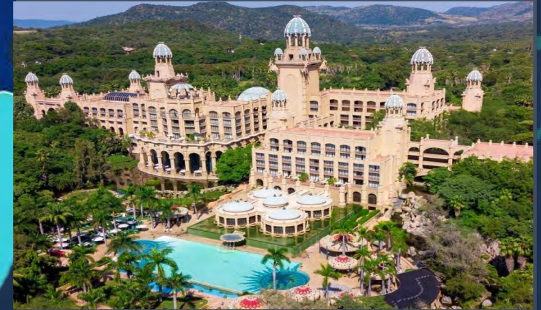
Sun City Resort