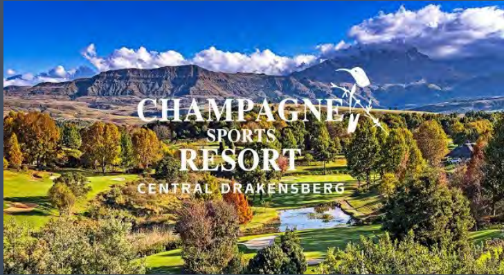
Champagne Sports Resort