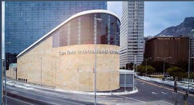
Cape Town International Convention Centre